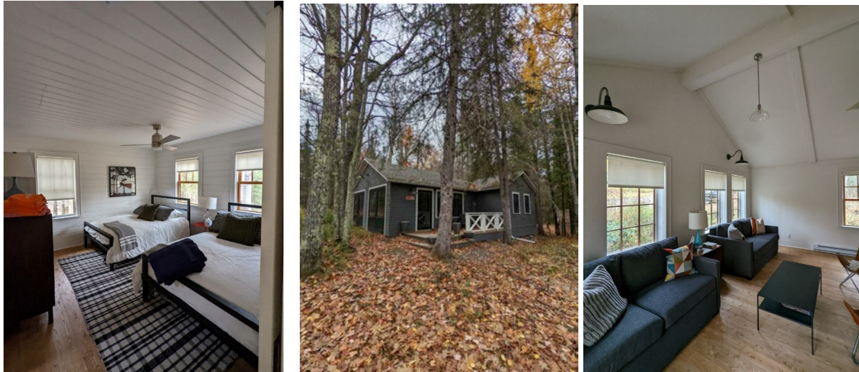
Accommodation at Chateau Madeline on Lake Superior.